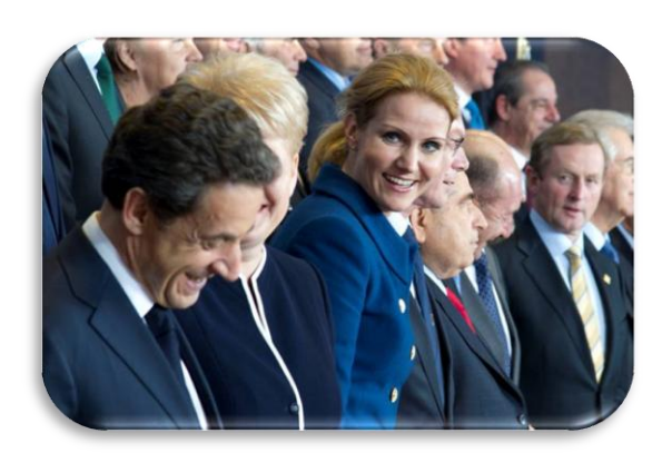
Crisis – what crisis?

Speculations as to whether Greece will leave the monetary union or not and what the effects will be is highly speculative and leading nowhere. I think most people realize that leaving will be a major catastrophe and more so for Greece then for the Union. Obviously deep worries on how one shall be able to regain growth are highly appropriate. However I think it is about time the Greek people realize that they have been having a party for more than 20 years and now it is over. They will simply have to start working again like the rest of us and they will also like the rest of us, be looking at carrying on until they are 70.