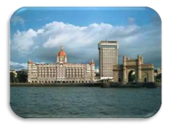
The Taj Mahal Palace & Tower

The conclusion from the tour is that India has a very ambitious program in a number of fields opening up huge potential markets to a vast number of European companies and speaking from experience easier to handle than the Chinese market.