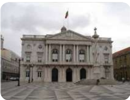
Government Building in Lisbon