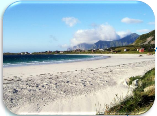
Flagstad – Lofoten- Norway Happy Summer Holidays!