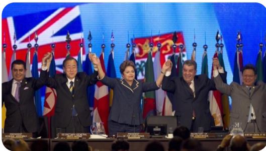
Rio + 20 Summit