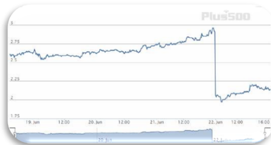
Share prices last week

prices, and is subject to changes in key assumptions up to the reporting of the second quarter," it added.