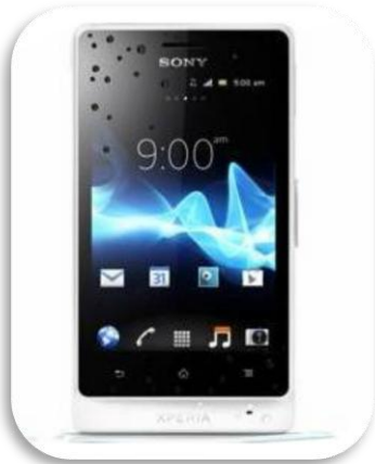
Sony Xperia Advance

phones tend to look like kids toy phone. However, the latest Sony Xperia Advance definitely doesn't look like one and definitely doesn't act like one. It is fully featured with outstanding specs and boasts the highest water and dust resistant in its class. We are still unsure about its ability to withstand drops and shocks but its abilities to extreme conditions like water and scratch resistant should be sufficient to label it under the rugged category. One of its significant features is the ability to use the touch screen despite under the rain.