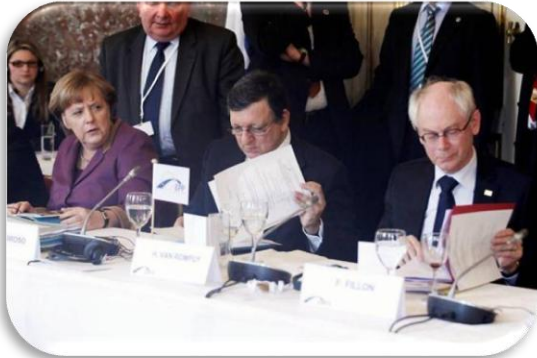
Germany's Chancellor Angela Merkel, European Commission President Jose Manuel Barroso and EU Council President Herman Van Rompuy

After a three and a half hour long emergency meeting said EU President Herman Van Rompuy early Friday morning that the leaders of the euro zone have agreed to create a mechanism that allows for the emergency fund to help to lower interest rates not only to crisis-affected countries but also countries with reasonably healthy finances, and recapitalise crisis banks.