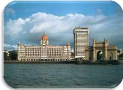
The Taj Mahal Palace & Tower

The conclusion from the tour is that India has a very ambitious program in a number of fields opening up huge potential markets to a vast number of European companies and speaking from experience easier to handle than the Chinese market.